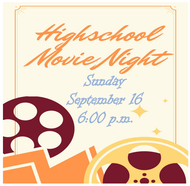
Pizza, drinks, and snacks provided.