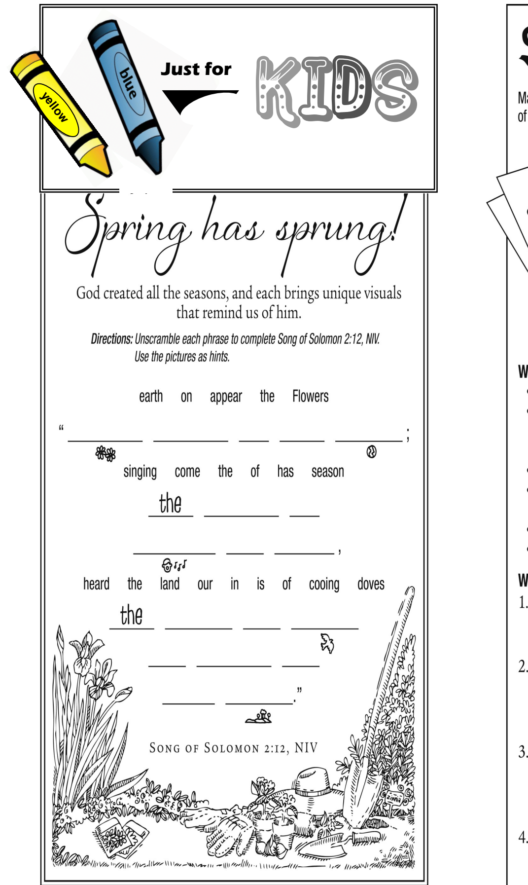
Answers: "Flowers appear on the earth; the season of singing has come, the cooing of doves is heard in our land."