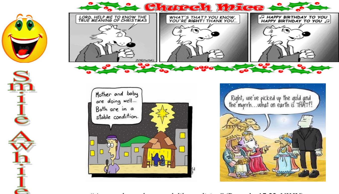
"A merry heart does good, like medicine" (Proverbs 17:22, NKJV).

The Proclaimer is a monthly publication of the First Baptist Church of Torrance, California, located at 2118 West Carson Street (6 blocks east of Crenshaw). Sunday services: 9:15 a.m. Worship Gathering (Contemporary Service); 11:00 a.m. Blended Service (with Sunday School for all ages); and 6:00 p.m. Evening Service. Mid-week events for children and students: C4 College; C4 High School; C4 Jr. High Quest ; and Colossians Kids for children.