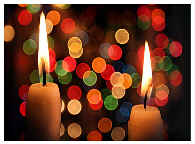
Family Christmas Candlelight Service Sunday, December 23 6:00 p.m.

Please mark your envelope: "Pastoral Staff Christmas."