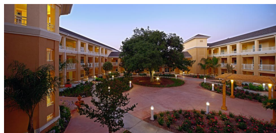
View of the courtyard of Atherton Baptist Homes.